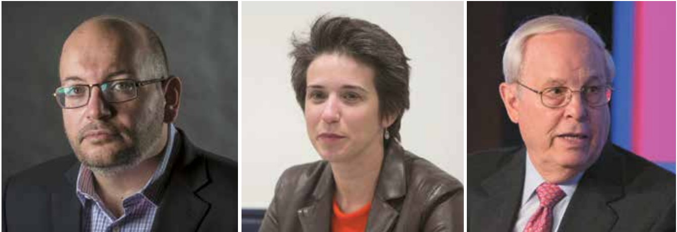
Recent Terker Distinguished Fellows include Washington Post reporter Jason Rezaian (2016-17), Amy Walter (2015-16), and Frank Fahrenkopf Jr. (2015-16).